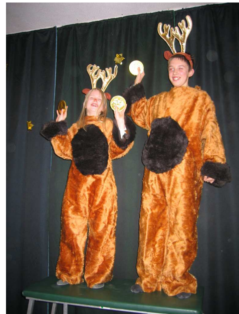
TVOC's new O suit is modelled at Burford party